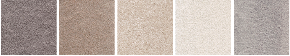
SATIN 94 SATIN 31 SATIN 33 SATIN 03 SATIN 90