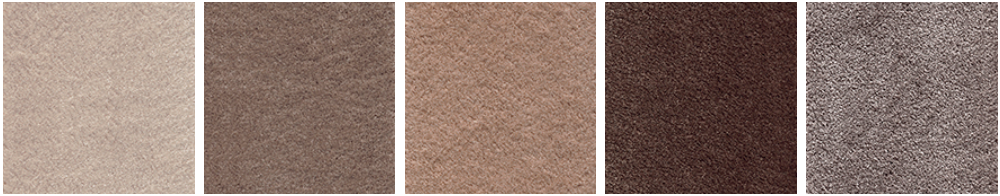
SATIN 32 SATIN 34 SATIN 35 SATIN 42 SATIN 39